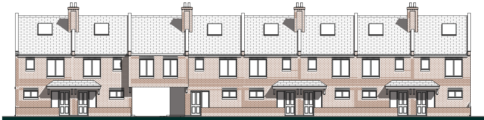
NORTH ELEVATION (JUDGE STREET)